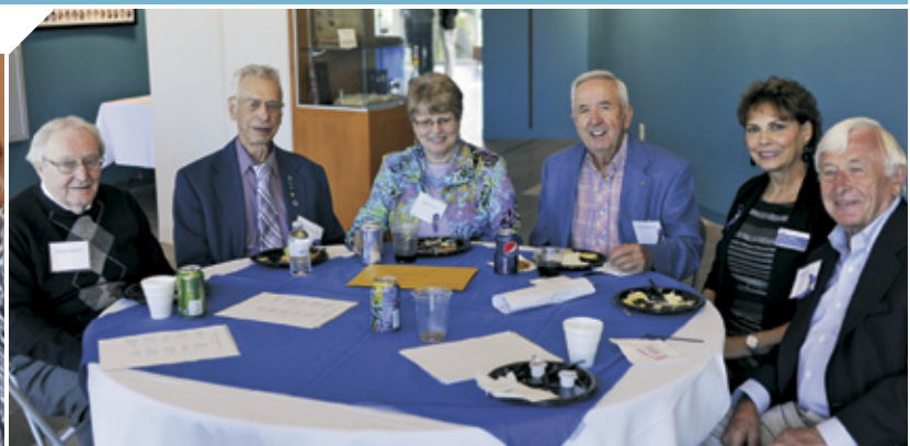
Class of 1953