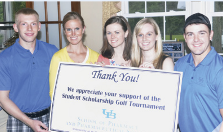
Golf scholarship recipients