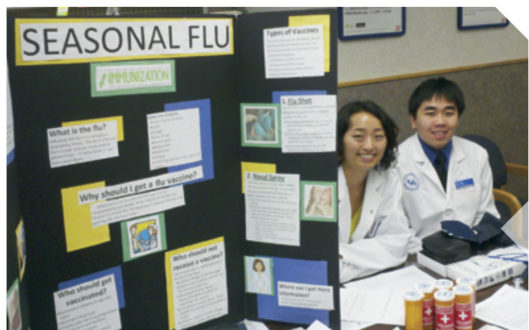
Operation Self Care

Operation Immunization is an education campaign designed to increase the public's knowledge of immunizations while increasing adult vaccination rates.