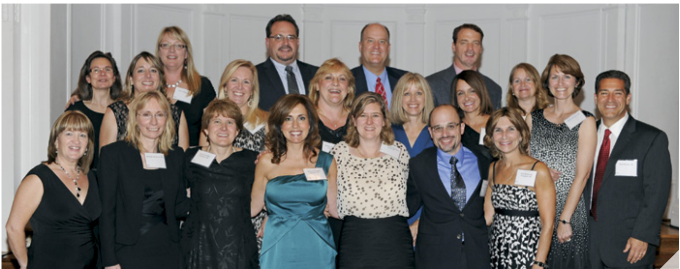
Class of 1988